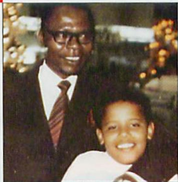
Like father, like son? One of just two meetings between the generations.

But instead of readying us for the challenge, our President is trapped in his father's time machine. Incredibly, the U.S. is being ruled according to the dreams of a Luo tribesman of the 1950s. This philandering, inebriated African socialist, who raged against the world for denying him the realization of his anticolonial ambitions, is now setting the nation's agenda through the reincarnation of his dreams in his son. The son makes it happen, but he candidly admits he is only living out his father's dream. The invisible father provides the inspiration, and the son dutifully gets the job done. America today is governed by a ghost. F